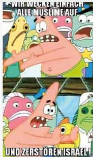
Character from SpongeBob with hateful message put into his mouth 'We just wake up all Muslims and destroy Israel'

Young people often find the 'cool' design and the provocative statements in the images attractive and integrate them in their profiles in the social media. By these means, the messages also reach young users who are not part of the extremist scene.