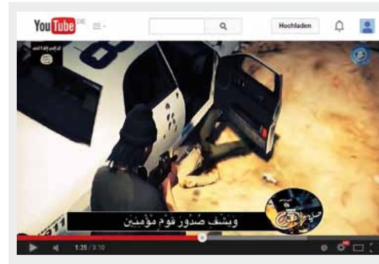
The Islamic State uses popular videogames like Grand Theft Auto as basis for recruiting young people

Videos are a main instrument of Islamist propaganda on the web. Forms, functions and subjects vary widely: There are recruitment videos for armed Jihad, recordings of hate preachers as well as scenes from conflict areas showing torture and executions. Furthermore, Islamists also make fiction films and try to address young people by presenting stories from everyday life and using popular figures.