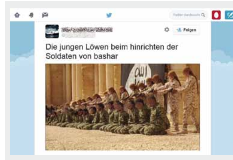
Jihadists present children as executioners

In other scenes Jihadist groups present themselves as guardians and 'carers'. Images and videos on the web show followers of IS as they distribute sweets, toys, clothes and food to children in areas they occupy. This sends the message that the Islamic State ensures security and cares for the wellbeing of the little ones. Among others, the video shows German Islamists and addresses in particular a German audience. The message is that the just cause is worth fighting for.